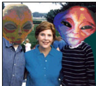
Visiting with Laura Bush

First Lady Laura Bush spent this past week showing the Gozers all around Washington DC, where they visited with important people.