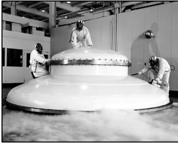
Scientists look at Gozer ship

The Riot! has learned that visitors from space landed in Boise, Idaho on March 22nd. They landed in a potato field next to offices where self-advocates