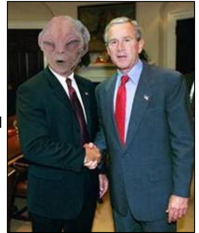
A Presidential Handshake